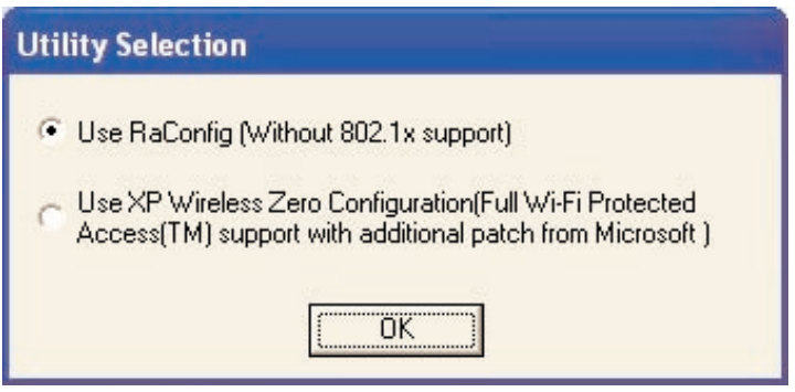
Figure 4-6. Selecting the utility.

When WPA is enabled, there are two utility selections (either RaConfig or Wireless Zero Configuration) when you open the card's Configuration Utility (see Figure 4-6). Select the XP built-in utility with full WPA function. If you select XP Wireless Zero Configuration, you can only configure the Advance setting or check the Link Status and Statistics from the RaConfig utility. From Figure 4-6, click on OK to save your selection.