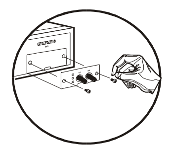
Figure 2: Removal of cover plate