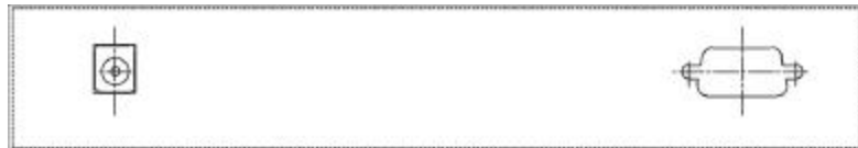
Figure 2: Rear view

Step 2: Attach the plug into a standard AC outlet with the appropriate AC voltage.