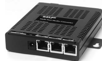
Multi Port Media Converter with wall-mount bracket attached