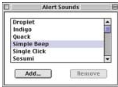
Figure 2-3. Alert Sounds dialog box.