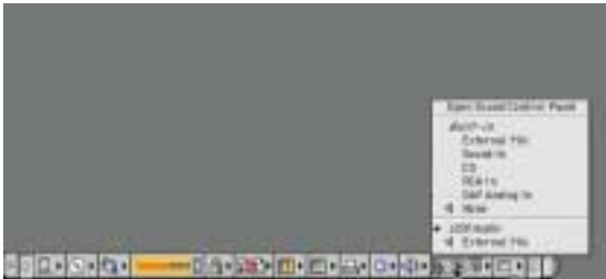
Figure 2-1. Selecting USB audio.

Click on the microphone icon on the control strip. In the pop-up menu, click on USB Audio .