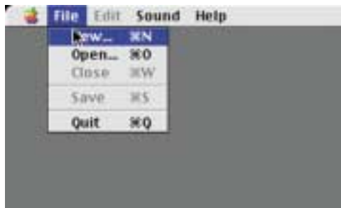
Figure 2-5. File and New.