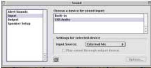
Figure 2-2. Sound Control Panel screen.

Open the Sound Control Panel and select Input . Verify that USB Audio is selected as the sound input source. If it is not selected, click on USB Audio in the list. Close the Sound Control Panel.