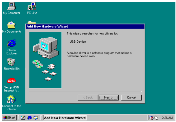
Setup4. Clink "Next"