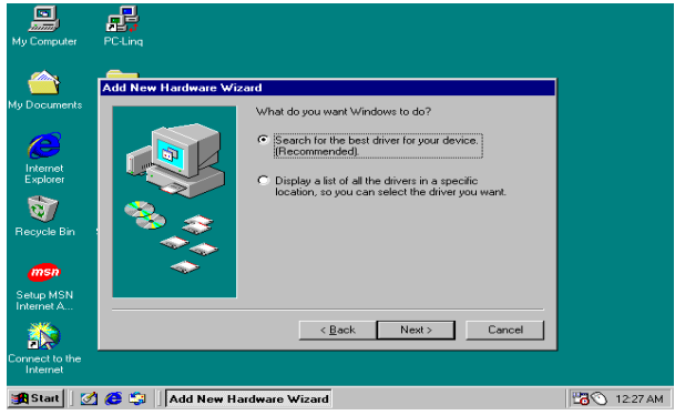
Setup5. Clink "Next"