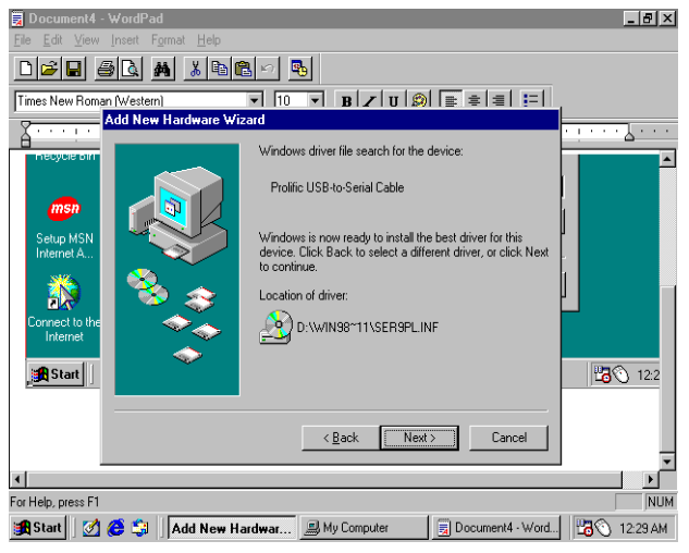
Setup7. Clink "Next"