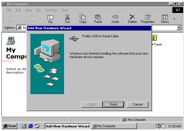
Setup8. Clink "Finish"