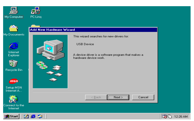
Setup3. Clink "Next"

Setup1. Insert CD disk (USB to serial converter V1.0) Setup2. Plug USB/Serial cable into your computer's USB port & choose your PC OS (win 95OSR2/98/2000/ME)