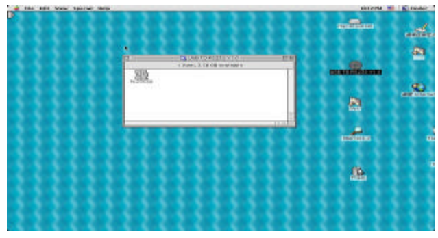
Setup5. You can see the file which you created.