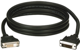
Figure 1. Example of DVI Cable