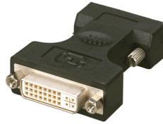
Figure 2. Example of DVI-to-VGA Adapter